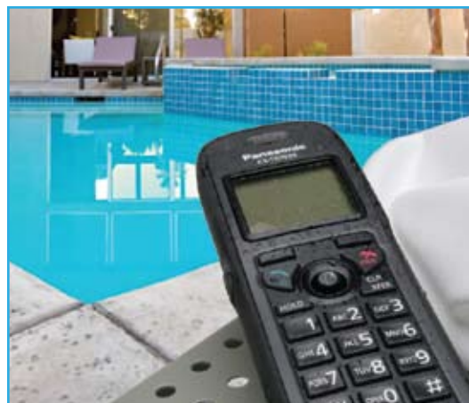
Dust & Splash Resistant