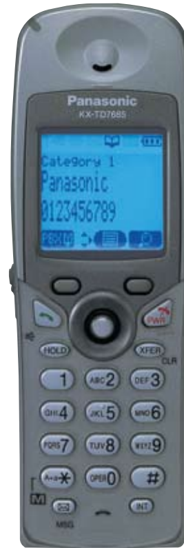
KX-TD7685 Standard Model