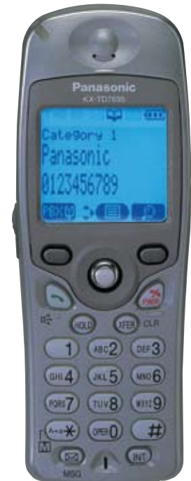
KX-TD7695 Compact Model